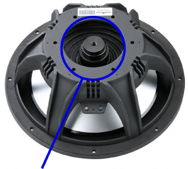
Three exchangeable weights for custom tuning