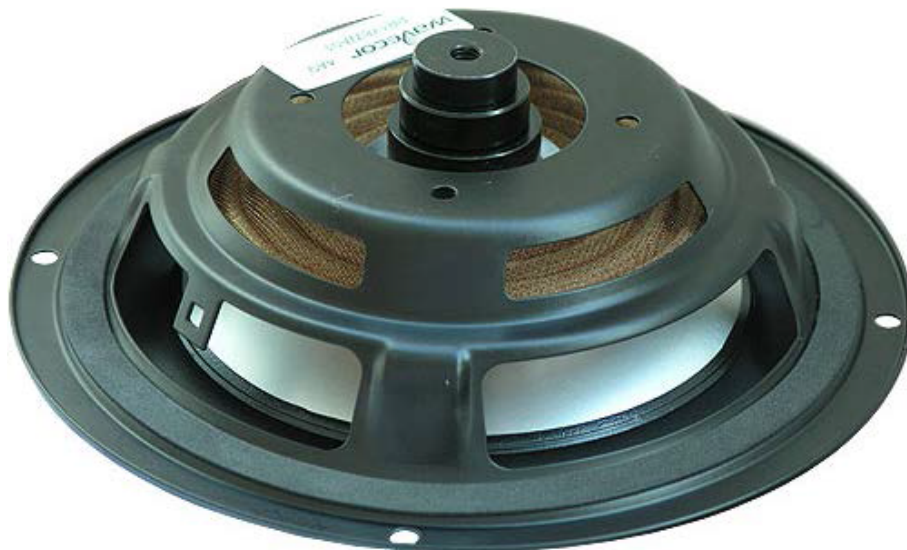
All 3 extra weights added at the same time (+35g)